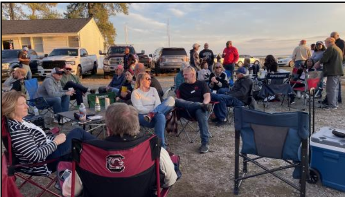
Beautiful weather graced our 2024 Oyster Roast, which hosted nearly 90 members and their guests.

We are blessed to have great volunteers to make our events happen, but it seemed to me that your willingness to go the extra mile truly shined through at the Oyster Roast.